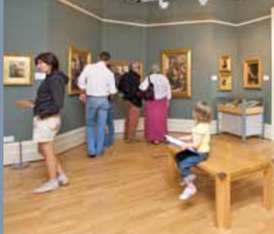
Visit to Award Winning Penlee House Gallery and Museum (admission charge applies)