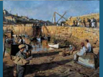
Fitting Out Mousehole harbour 1919 by Stanhope Forbes