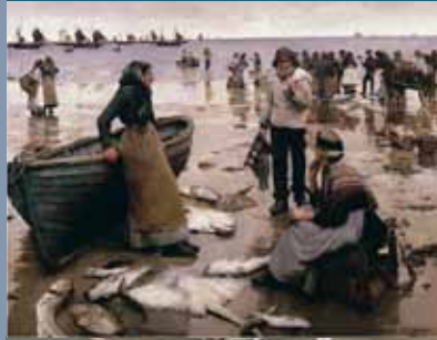
Fish Sale on a Cornish Beach, 1885 oil by S. Forbes

Taxis will be provided from The Queen's Hotel to Newlyn and from Newlyn to Mousehole and back, cost included.