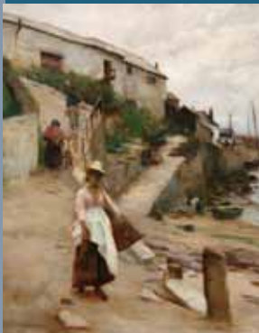
Old Newlyn harbour by William Banks Fortescue, 1891

Walk around picturesque Newlyn and see where artists lived and painted.