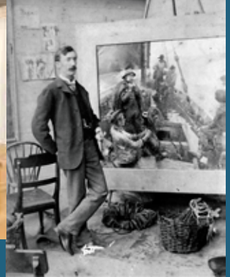
Stanhope Forbes, 1886 in his studio