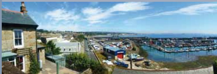
Visit artist's studios in Newlyn and see where historic pictures were painted.