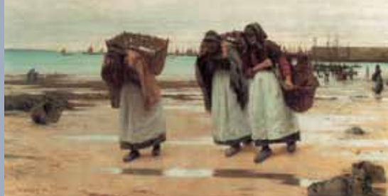
Breadwinners , watercolour by Walter Langley

Venue: Borlase Smart Room, Porthmeor Studios, Back Road West, St. Ives.