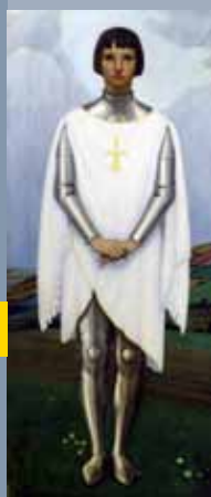
See the art in St. Hilary church