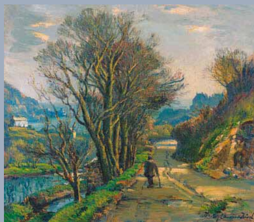
Visit the magical Lamorna Valley